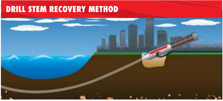
HammerHead rammers can recover expensive stuck drill stems. The rammer is attached to drill stem with a fabricated adapter. Impact force of the rammer combined with static pullback is used to extract stuck drill stems. Expensive drill stem is recovered.

Recover your product pipe using the extraction method. The impact force of the rammer is combined with static pullback to extract product pipe so you can save expensive pipe and bore again.