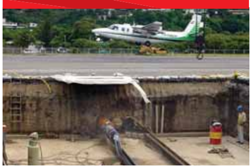
Project: Pipe bridge culvert under military runway Specifications: 26 rams of 24" steel pipe 60 meters each Equipment: 16" and 24" pipe ramming hammers