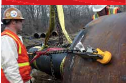
Project: New culvert under Burlington Northern Rail track Specifications: 30" & 60" steel casing Equipment: 24" pipe ramming hammer