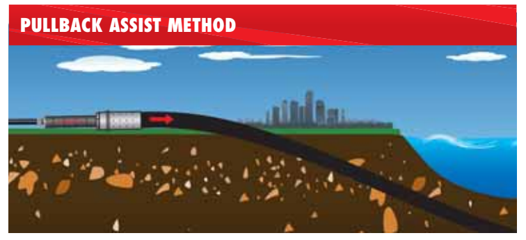
Free up hydro-locked or immovable pipe. The rammer is attached to product pipe during pullback and impact force assists HDD pullback to complete long and difficult projects.

Replace deteriorating or over capacity culverts without disruption to roads, railroads, and other structures. Ram a steel casing over the existing culvert and clean out to complete the installation.