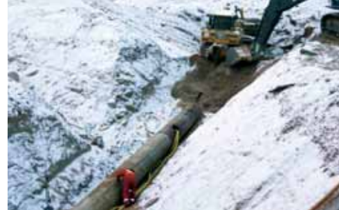
Project: Slick bore – Bannister oil pipeline project Specifications: 360' of 36" steel casing Equipment: 24" pipe ramming hammer