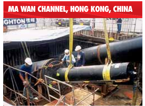
Project: Washover casing installation for HDD assist Specifications: 2-54^{\circ} casings 66' at a 20° angle Equipment: 24" pipe ramming hammer