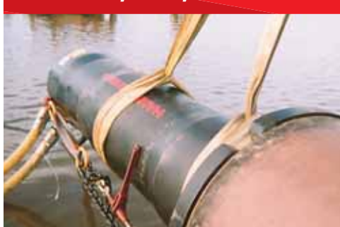
Project: Pullback assist – gas pipeline installation Specifications: 2,800' of 36" casing Equipment: 24" pipe ramming hammer